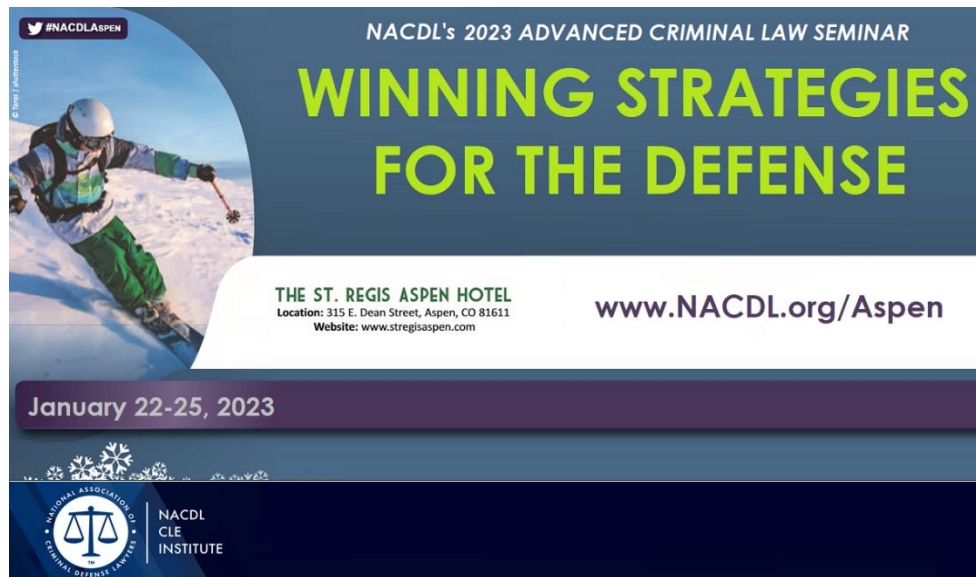
Exhibit & Sponsorship Prospectus

2023 Advanced Criminal Law Seminar January 22-25, 2023 Aspen, CO